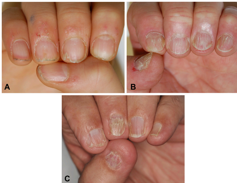
Fig 1. A , Mild nail lichen planus (NLP). Note the longitudinal ridging and splitting limited to the distal portion of the plate. Onycholysis is mild and nail bed hyperkeratosis is absent. B , Moderate NLP, featuring partial fissuring, longitudinal grooves, and distal splitting between 3 and 5 mm in length. Mottled erythema of the lunula can be roughly observed in the second fingernail. Onycholysis is more marked and nail bed hyperkeratosis can be observed in the thumb. C , Severe NLP, featuring complete fissuring and splitting >5 mm in length, onycholysis >50%, and diffuse erythema of the lunula.

While adverse events 35-37 including atrophy are possible, there is strong consensus that they are minimal or even nonexistent when this technique is used with appropriate training. 38 Hematomas and